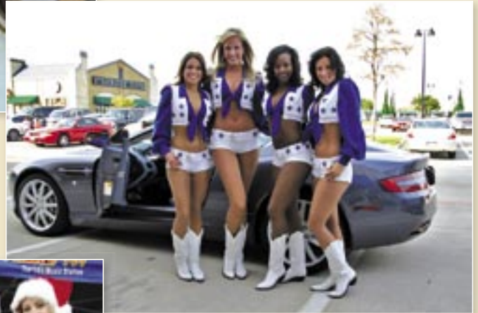
Dallas Cowboy Cheerleaders bear the cold in smiles in front of an Aston Martin.