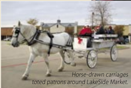
Horse-drawn carriages toted patrons around LakeSide Market.

There was something for everyone: kids' crafts, carriage rides, pictures with Santa (or Cowboy Cheerleaders), the Plano Fire Department and a very impressive LakeSide Market raffle sponsored by the LakeSide shops and restaurants!